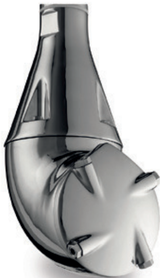
Image 2. Alfa Laval TJ20G Rotary Jet Head

Rotary jet head use the high impact and low flow of cleaning media to clean the tank.