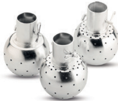
Image 1. Alfa Laval LKPK Static Spray Balls

Static spray ball the low impact and high flow of cleaning media combined with the force of gravity to clean the tank.